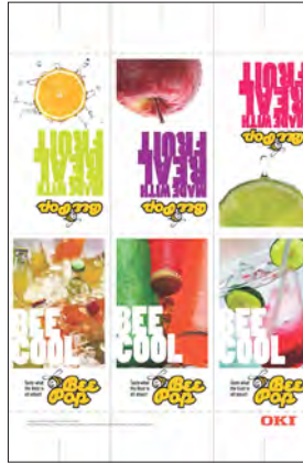
Table Tents – Spot Clear toner makes color even more vibrant on industry-standard substrates

Bottle Labels – White toner under CMYK on transparent film makes colors pop!